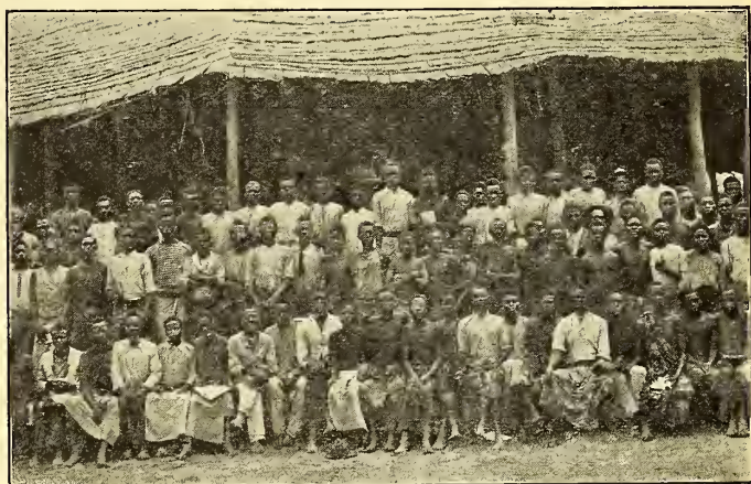
THE NATIVE CHURCH